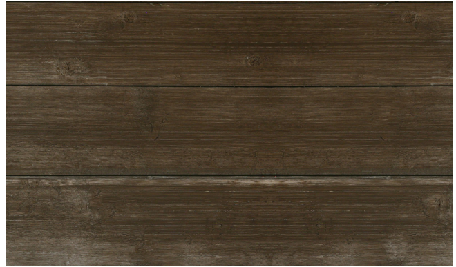
Prairie Brown BW18SLPB

Thickness: 7/8" | Width: 8" (6.5" Face including 1/4" Gap) Grade: Reclaimed Look | Profile: Shiplap with Nickel Gap