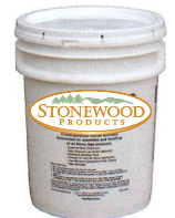
High Temp. All-Purpose Mortar