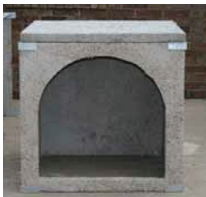
36" Wood Storage Box

NOTE: Concrete footing recommended - check local codes for details. High temp. mortar needed.