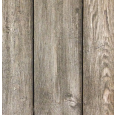
Prairie Brown BW18SLPB