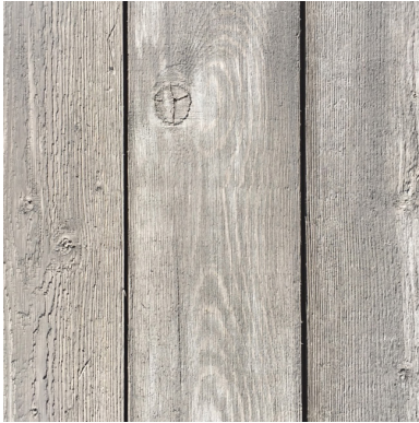
Barn Gray BW18SLBG

Our Barnwood Collection is the ideal design choice for architects and designers looking for a weathered, reclaimed wood without sacrificing affordability and integrity to your project. Add a unique element to your project with this rustic paneling.