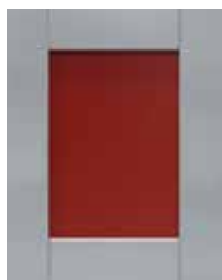
KEY WEST FROST Shown in Redwood