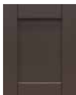
METALLIC BRONZE MATTE