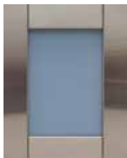
SKY BLUE SEA GLASS INSERT