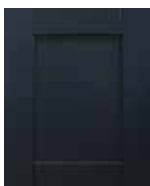
PEARL NIGHT BLUE