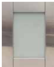
SEAFOAM GREEN SEA GLASS INSERT