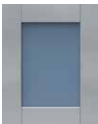
SEA GLASS Shown in Sky Blue