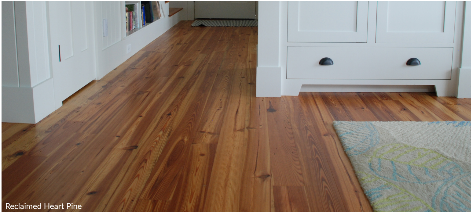
Reclaimed Heart Pine

Reclaimed Heart Pine is available by special order - inquire with us for information