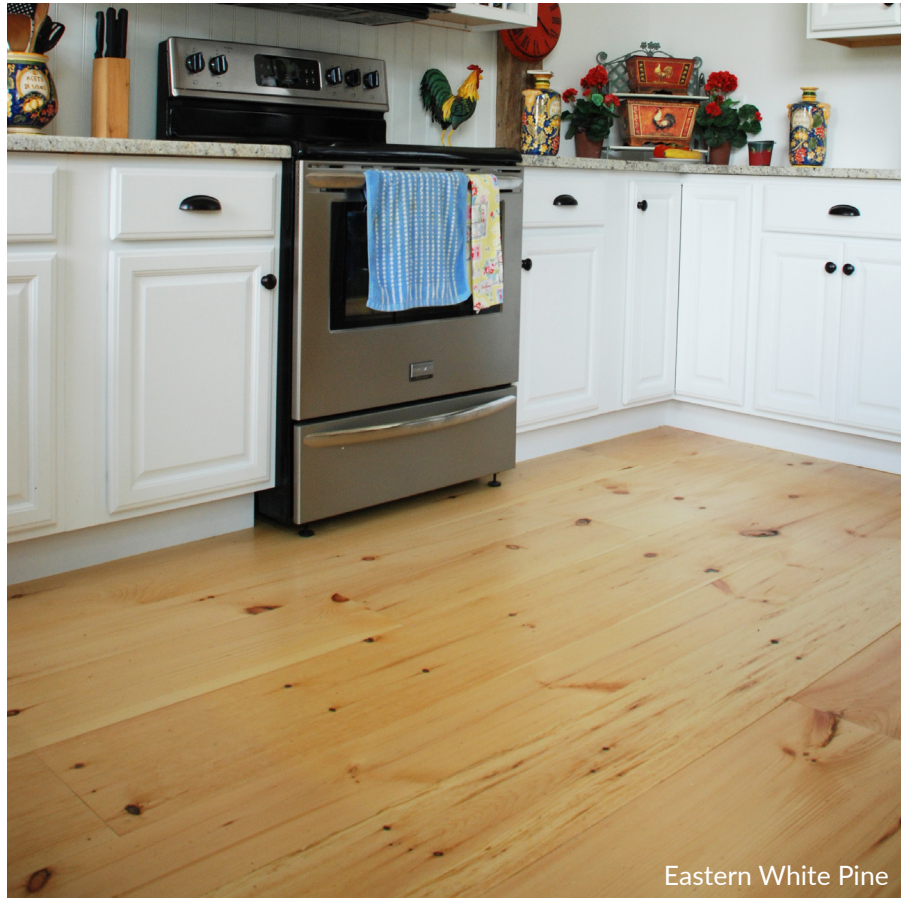
Eastern White Pine

Boards are square-edged, tongue and groove, or shiplap.