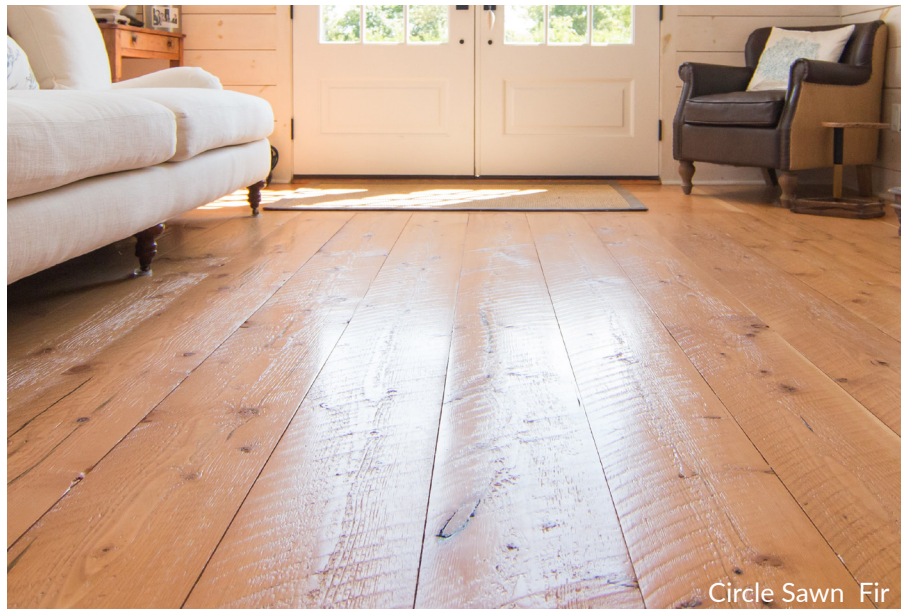
Circle Sawn Fir

Widths: Special Order Only (Generally 6"-8"-10" Mix)