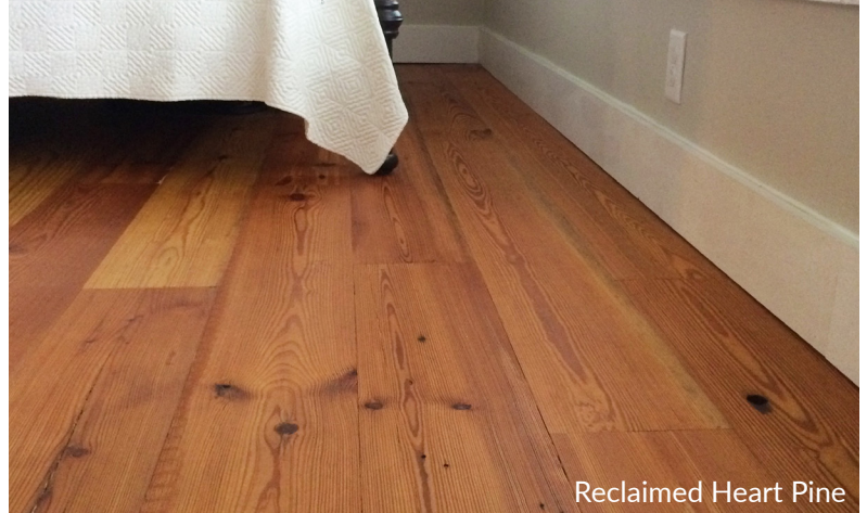
Reclaimed Heart Pine

Antique Heart Pine was used extensively hundreds of years ago in factories and warehouses built during the Industrial Revolution and was once the most functional wood for construction in America. A slow-growing tree, taking 200 to 400 years to mature, it has a patina and sought after tight rings which stem from its 'old growth' and lends the strength to this unique wood.