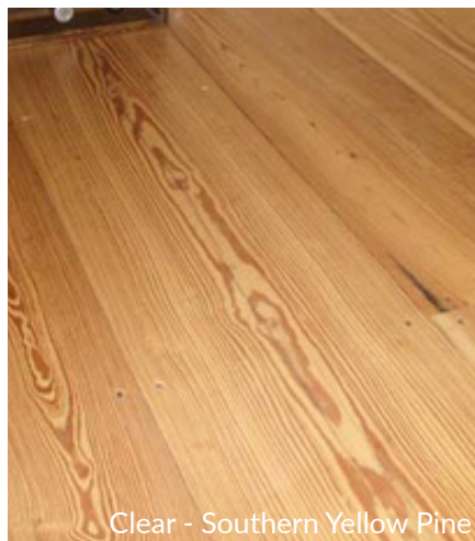
Clear - Southern Yellow Pine