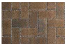
Sierra Tumbled Special Order