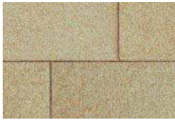
Summer Wheat Umbriano Finish Special Order