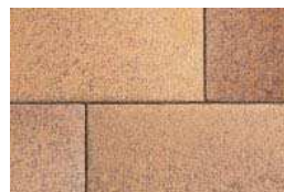
Autumn Sunset Umbriano Finish Special Order