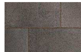
Midnight Sky Umbriano Finish Special Order