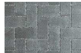
Granite Blend Tumbled Finish Special Order