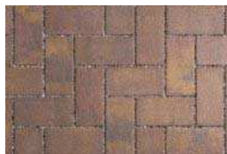
Coffee Creek Tumbled Finish Special Order