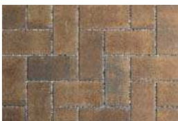
Sierra Standard Finish