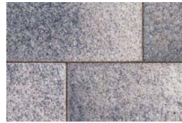
Winter Marvel Umbriano Finish Special Order