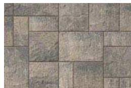
Steel Mountain New for 2016