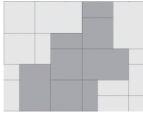
Beacon Hill A