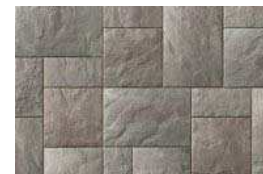
New York Blend