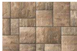
Bavarian New for 2016