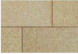
Summer Wheat Umbriano Finish Special Order