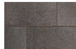
Midnight Sky Umbriano Finish Special Order