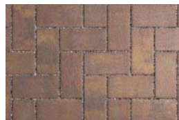
Coffee Creek Tumbled Finish Special Order