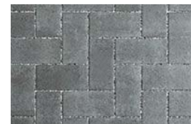
Granite Blend Tumbled Finish Special Order