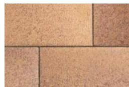
Autumn Sunset Umbriano Finish Special Order