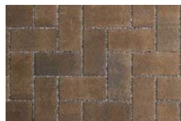
Sierra Tumbled Special Order