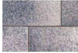
Winter Marvel Umbriano Finish Special Order