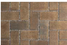
Sierra Standard Finish