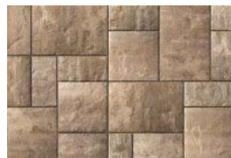
Bavarian New for 2016