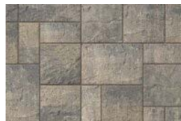
Steel Mountain New for 2016