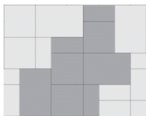
Beacon Hill A