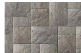
New York Blend